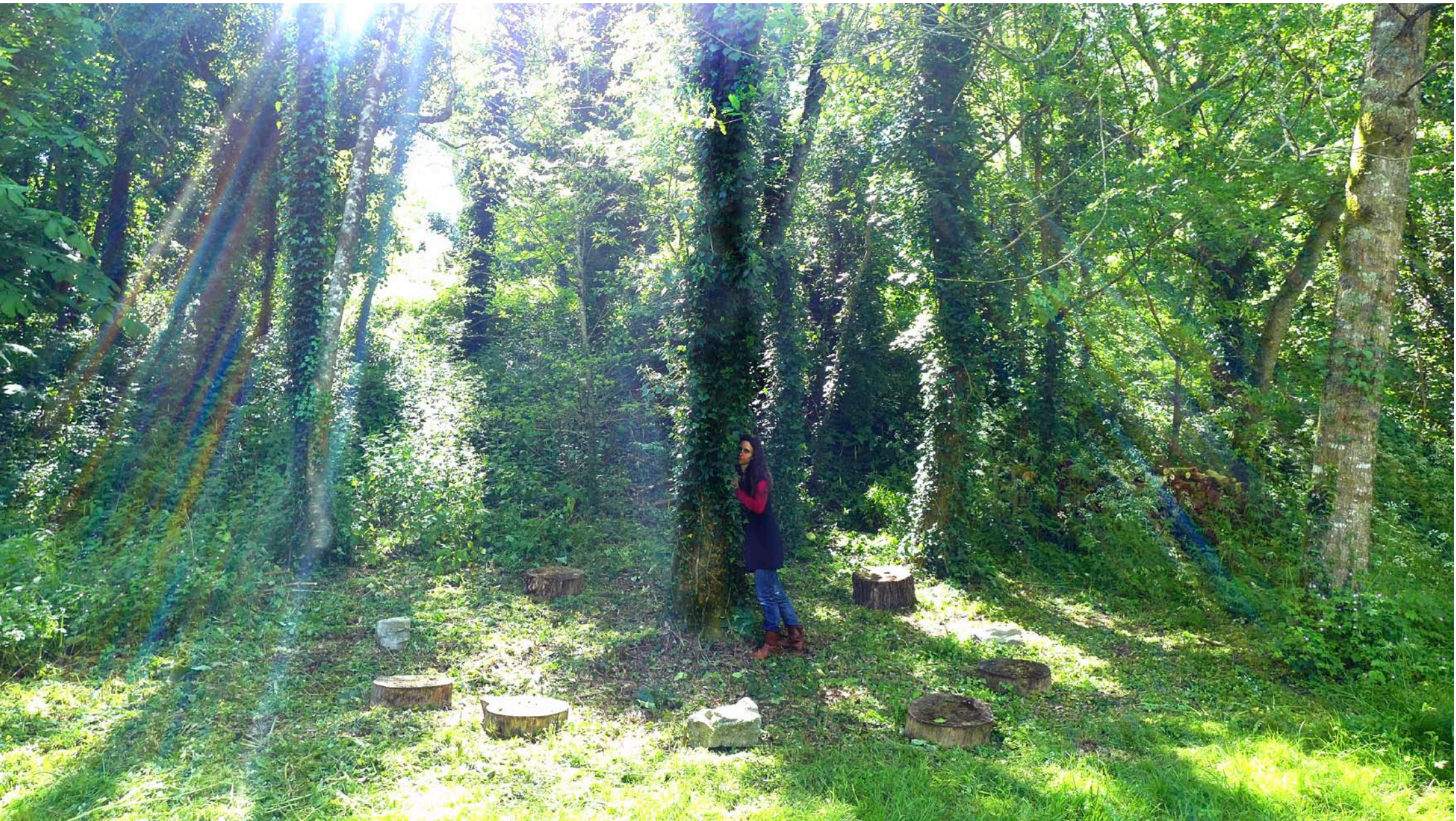
Maison de la Rivière / Communauté de communes - Montaigu-Rocheservière (Fr)