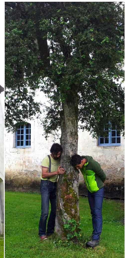
Abbaye de l'Escaladieu / «Arbres, regards d'artistes» - Bonnemazon (Fr)