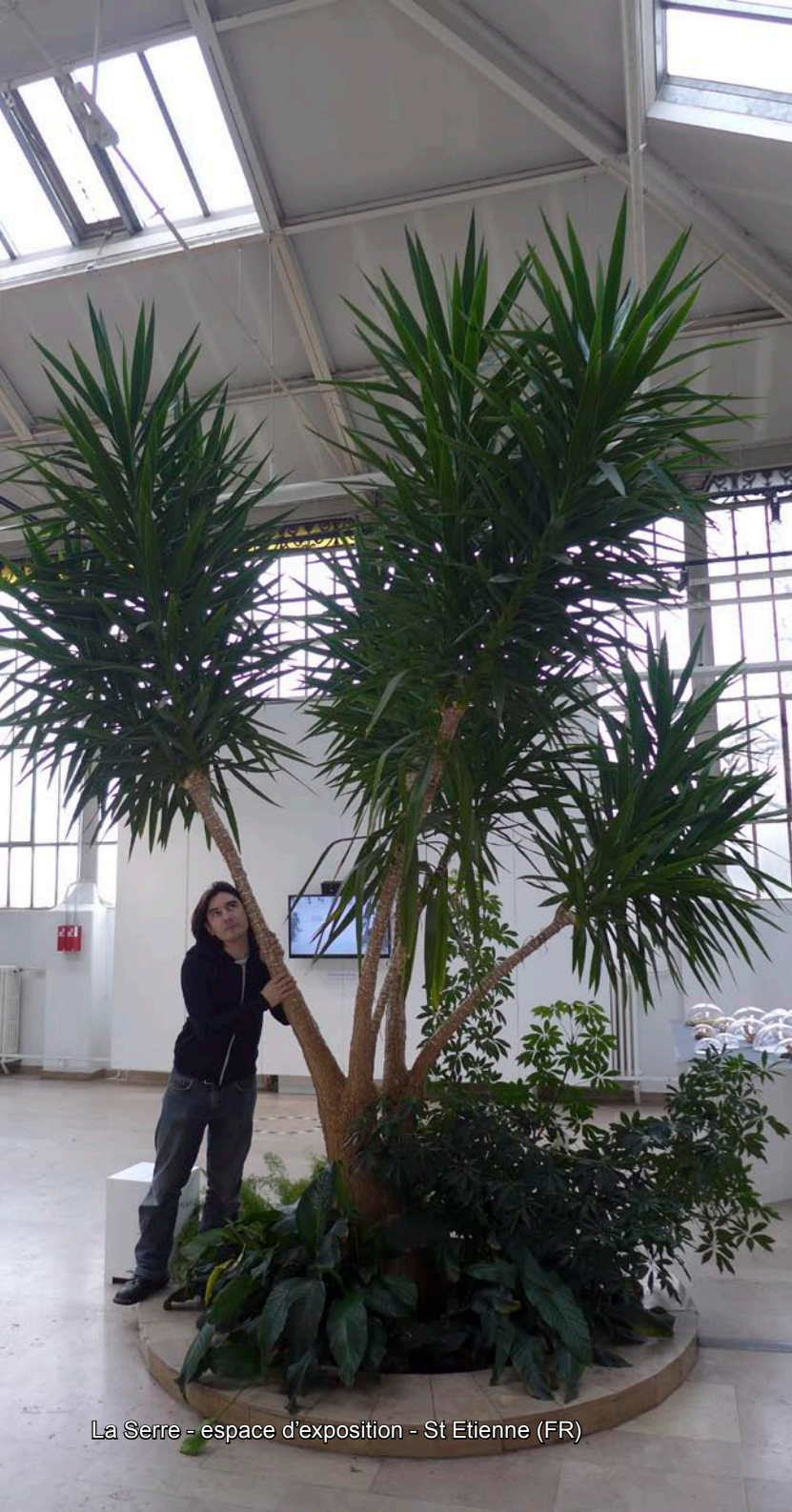
La Serre - espace d'exposition - St Etienne (FR)