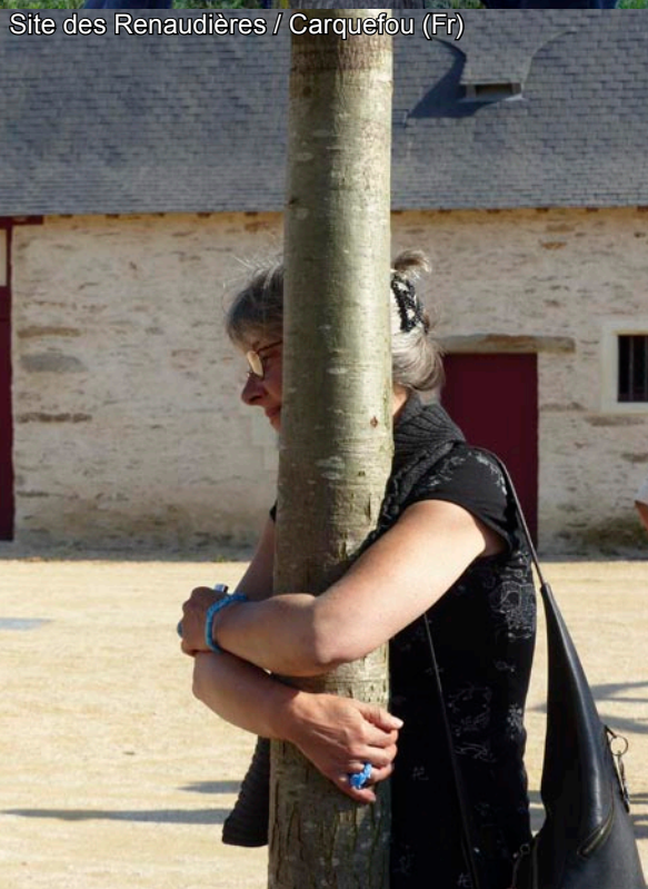
Site des Renaudières / Carquefou (Fr)