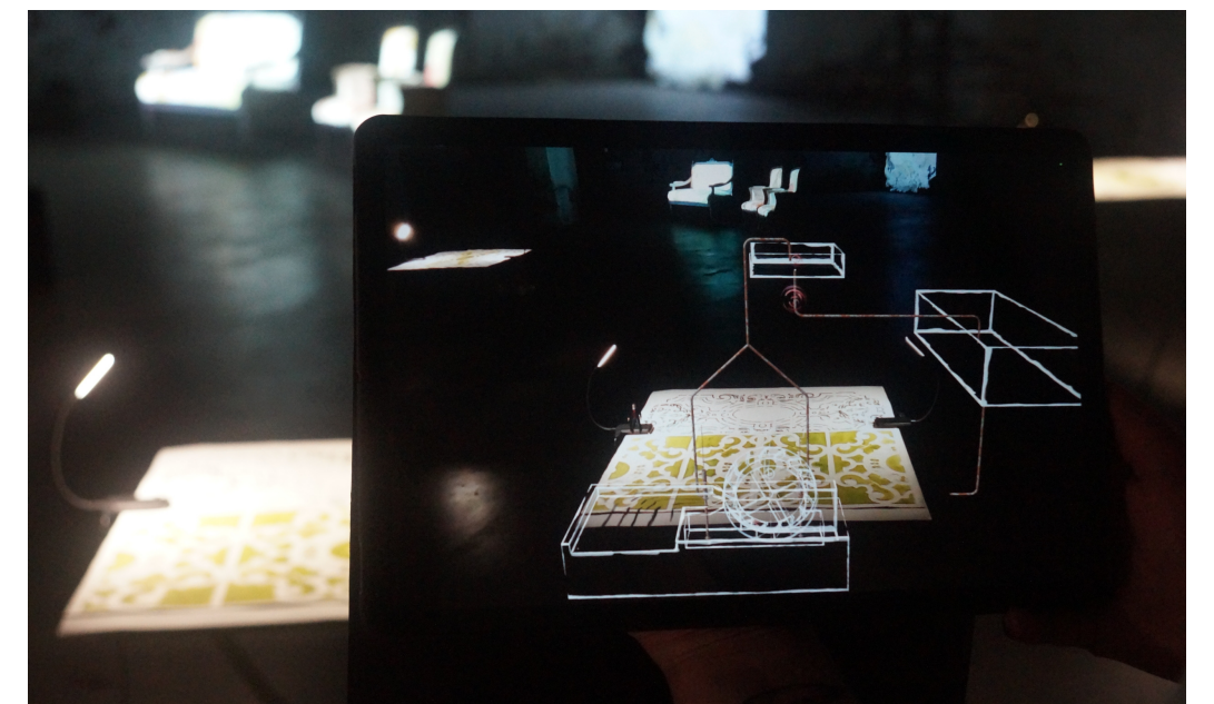
Blaise Pascal et les jardins , Annie Bascoul | Chapelle de l'Oratoire Clermont-Ferrand | © photo : VIDEOFORMES | VIDEOFORMES 2023